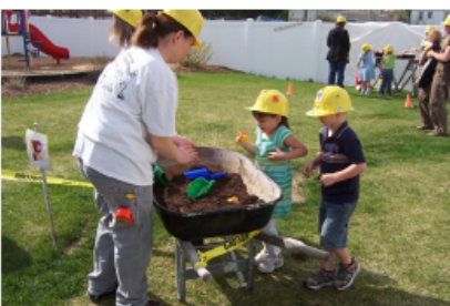
Under Construction Investigation in Head Start

Victor: What are some examples of it in action?