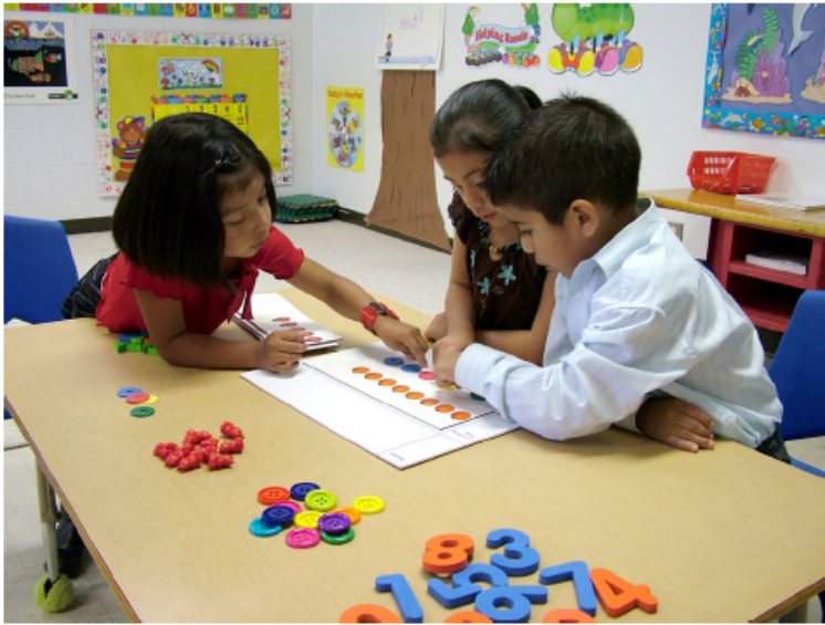
Magnetic Math Kit