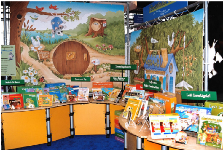
The InvestiGator Club® Prekindergarten System

Judi: The InvestiGator Club Prekindergarten Learning System is a comprehensive, developmentally appropriate, fully integrated preschool curriculum for children ages 3-5. This award-winning program is organized into seven inquiry-based Investigations, each based on a science theme, such as water, plants, animals, or health. Children develop skills through “purposeful inquiry” as they join the characters to investigate the real world.