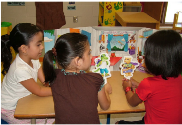
Dramatic Play Scene and Stick Puppets

can be applied to all ages is that an effective learning system starts with a student's quest to know more about a topic, engages the student in the investigative process through questioning and experimentation, and immerses the student in critical thinking and rich language experiences that foster good communication skills. Whether I am wearing my Rainbow hat or my Robert-Leslie Publishing hat, I enjoy applying these underlying principles to every educational project we touch.