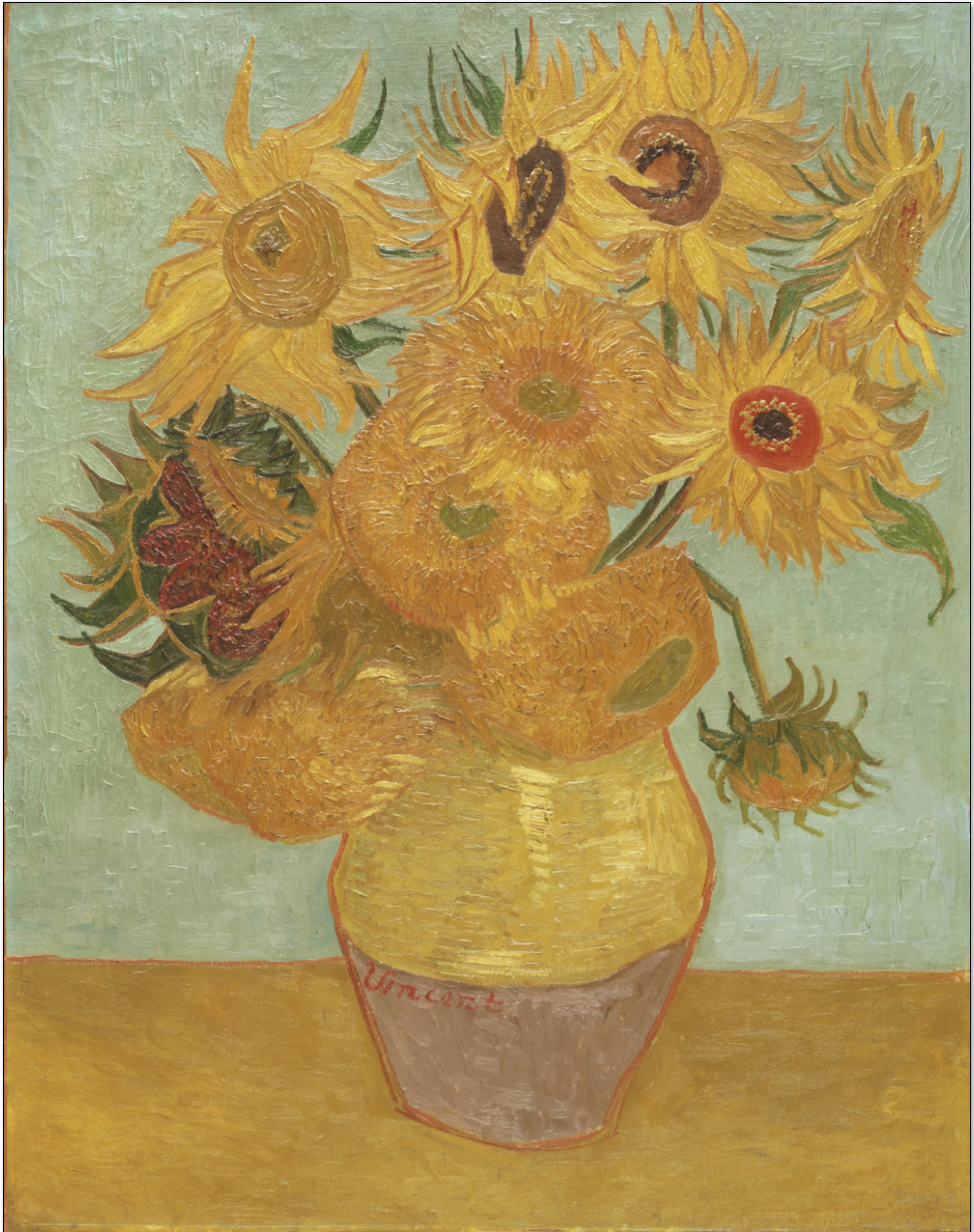
Sunflowers, Vincent van Gogh, 1888 or 1889.