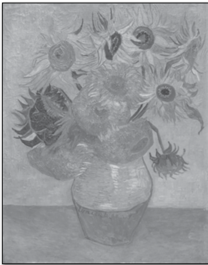
Sunflowers, Vincent van Gogh, 1888 or 1889.